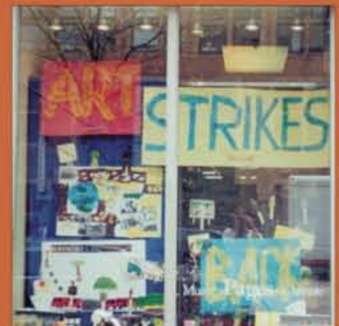
Window of Pages bookstore, Mayworks 1994.