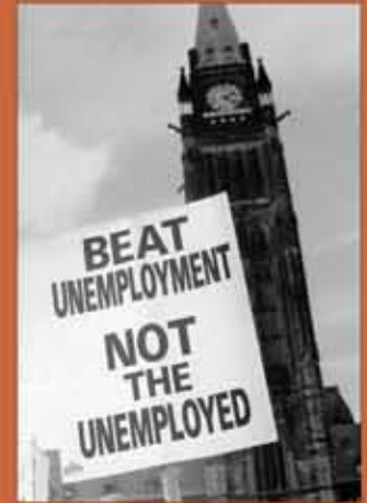
From The Working Image IV, Mayworks 1992.