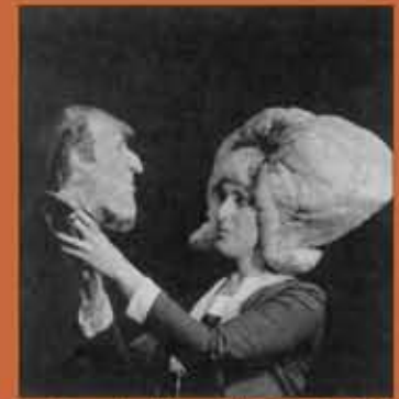
Scene from Womantalk, Mayworks 1995.