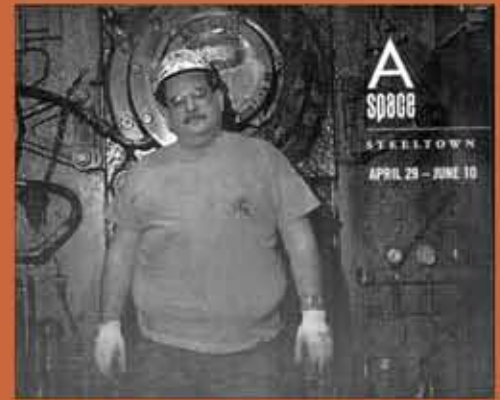
Postcard from Steeltown, an exhibition held at A Space Gallery during the first Mayworks festival in 1986.

It is Mayworks' 20th anniversary. The lineup includes a Double Deck(ade) Cabaret; Working Images; an Action Caucus forum; the Bal Moderne community dance; the Turtle Gals Performance Ensemble; and a photo exhibit of stories from Chinese-Canadian women garment homeworkers.